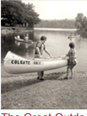
The Great Outdoors